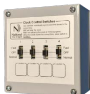
980-4-SA Manual Switches